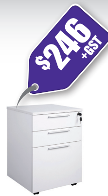
Cubit 2 Drawer + File Mobile