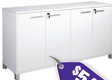
Cubit 1800 Credenza