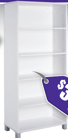
Cubit 1800 Bookcase